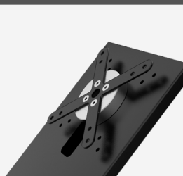
75X75MM 100X100MM VESA COMPLIANT