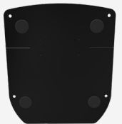
ANTI SLIP BASE PADS