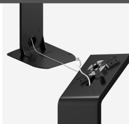
BUILT-IN CABLE MANAGEMENT