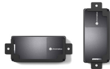
HORIZONTAL OR VERTICAL MOUNTING