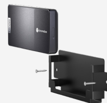
QUICK AND EASY TO SET-UP